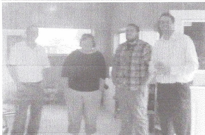
Attendees of the ground breaking enjoyed tours of Poggenpohl Redi-Mix and the Macoupin County Animal Shelter.