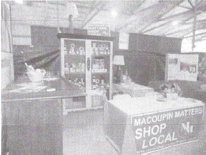
Macoupin Made products booth inside the Bates Building during the 2012 Macoupin County Fair.