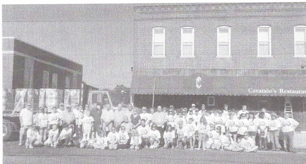
Staunton Paint the Town Project Sponsors: R.P. Lumber, Glidden Paint, Staunton City Officials, Assembly of God – Mission Reach youth and volunteers officially kick off Staunton's downtown makeover.